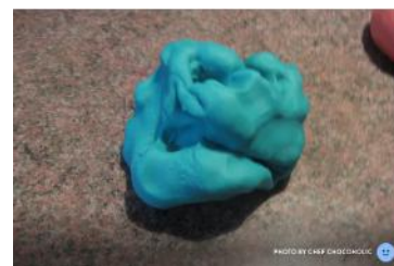
Kool-Aid Scented Play Dough Recipe here .

Elementary learning , as with most learning, is done best with hands on activities. A fun activity for kindergarten was to make smelly play dough and then use it to practice physical changes. Hands-on learning helps bridge the gap between the digital and physical worlds, making complex concepts easier to grasp.