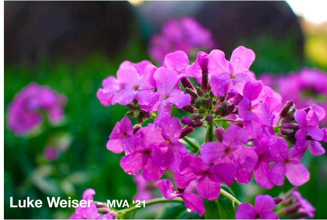
Luke Weiser - MVA '21