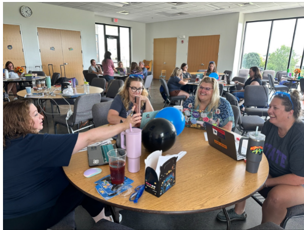
MVA teachers and staff spent a fun two days meeting to plan out the 2023-2024 school year.